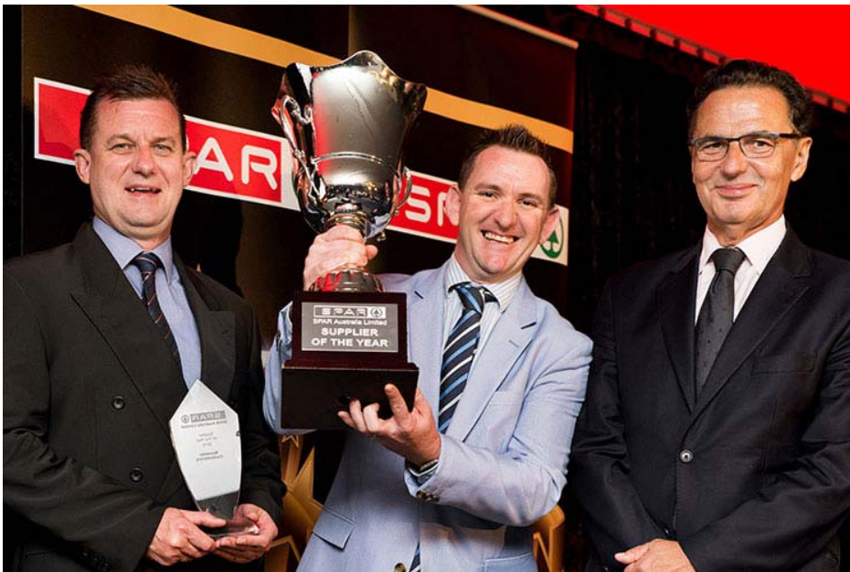
The 2016 SPAR Australia Supplier of the Year, Mondelez Confectionery

Amsterdam, The Netherlands, 2017-Mar-29 — / EPR Retail News / — SPAR Australia has once again recognised the support of key suppliers across various categories, presenting the coveted annual SPAR Supplier of the Year Awards at a dinner hosted by Australian Olympic Gold Medallist, Duncan Armstrong, earlier this month.