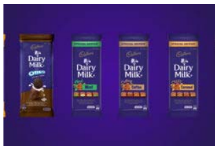
Cadbury encourages fans to be 'Flavour Braver' on World Chocolate Day