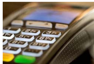
ACCC issues payment surcharge warning for small businesses