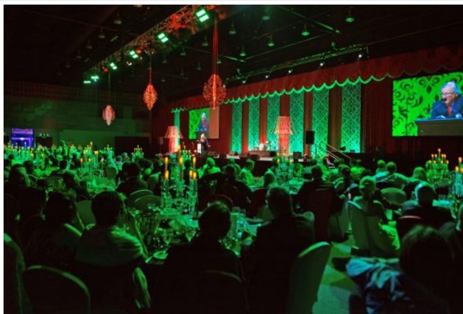
SPAR Australia Gala Awards Dinner 2016

Now in its fifth year, the SPAR Retail Awards Program identifies and recognises retailers excelling in their businesses. Through communication of the judging criteria and many hours spent in stores by the regional business managers, stores have had the opportunity to strive for recognition under this program.