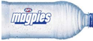
Pump launches AFL range