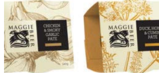
Maggie Beer's new pates with signature flavours